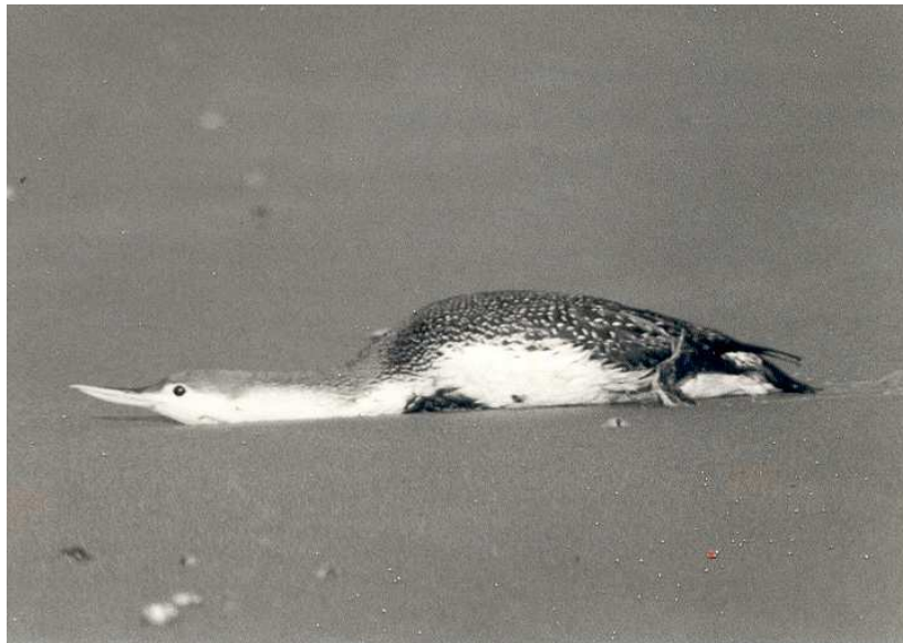
Oiled Red-throated Diver on sandy beach